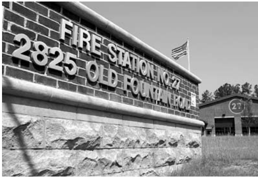
Fire Station 27