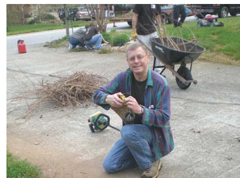
The "Bank of Good Will" pays dividends to our seniors