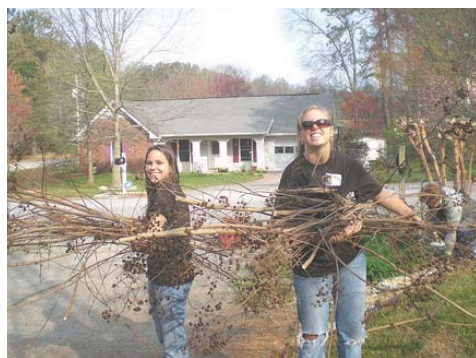
Smiling Sugarloaf volunteers cheerfully help seniors with chores