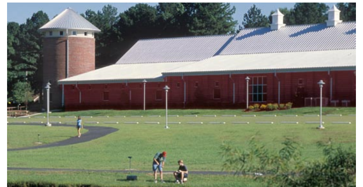
The Centerville Community Center is located at 3025 Bethany Church Road in Snellville.

When the Centerville Community Center opened in 2004, the County expanded the availability of health and human service programs to the population in south Gwinnett. Today, many outside organizations have collaborated with the County in all of the Health and Human Services Division's service centers to produce a wide variety of health and human service enrichment programs for citizens of all ages and cultures.