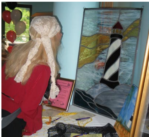
Auction items will include several pieces of fine art. The 2005 auction raised more than $13,000 for Gwinnett Senior Services.

"The silent auction raises much-needed funds for Gwinnett's growing senior population," said