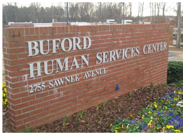
The Buford Human Service Center houses several helpful agencies.