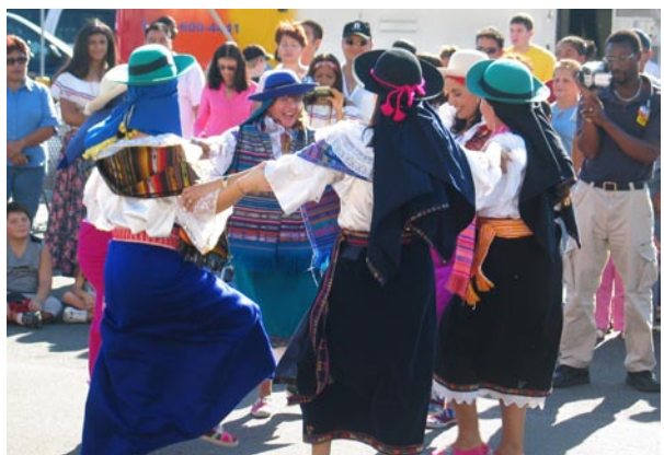
Grupo Folclorico Internacional performed at last year's Hispanic Heritage Celenration held at the Wal-Mart Super Center at Sugarloaf Parkway and Highway 29. More than 2,500 people were in attendance.