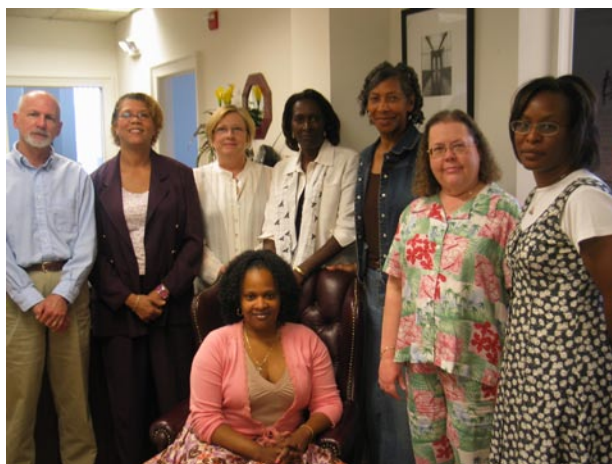
The Senior Services case management team is vital in providing resources and volunteers to satisfy age-related needs.