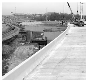
I-85/SR 316 Interchange