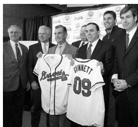
Gwinnett Braves Press Conference