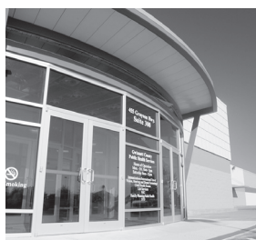
Gwinnett County Public Health Services