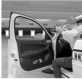
Police Training Center