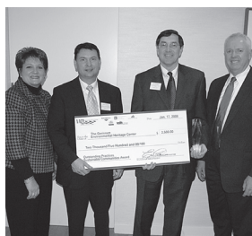
NACo Center for Sustainable Communities Award

gwinnett county government access cable channel 23