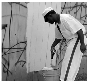
Inmates paint over gang-related graffiti