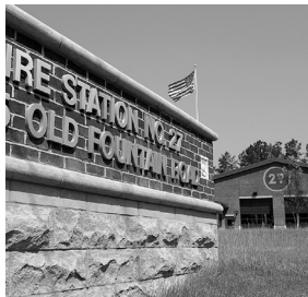
Fire Station 27