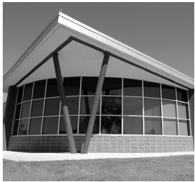
Animal Welfare Center