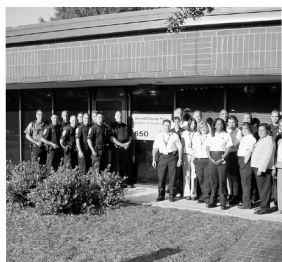
Quality of Life Unit Office