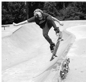
DeShong Park Skate Area