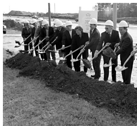
Sugarloaf Parkway Extension Groundbreaking