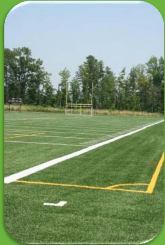
Peachtree Ridge Park