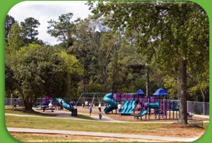
Ronald Reagan Park renovation