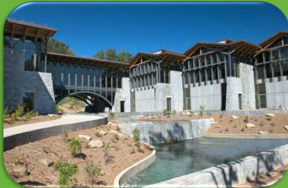
Environmental and Heritage Center