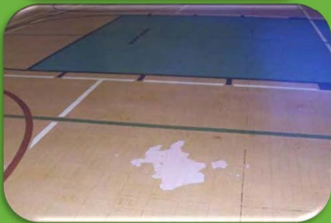
Best Friend Park Gymnasium renovation