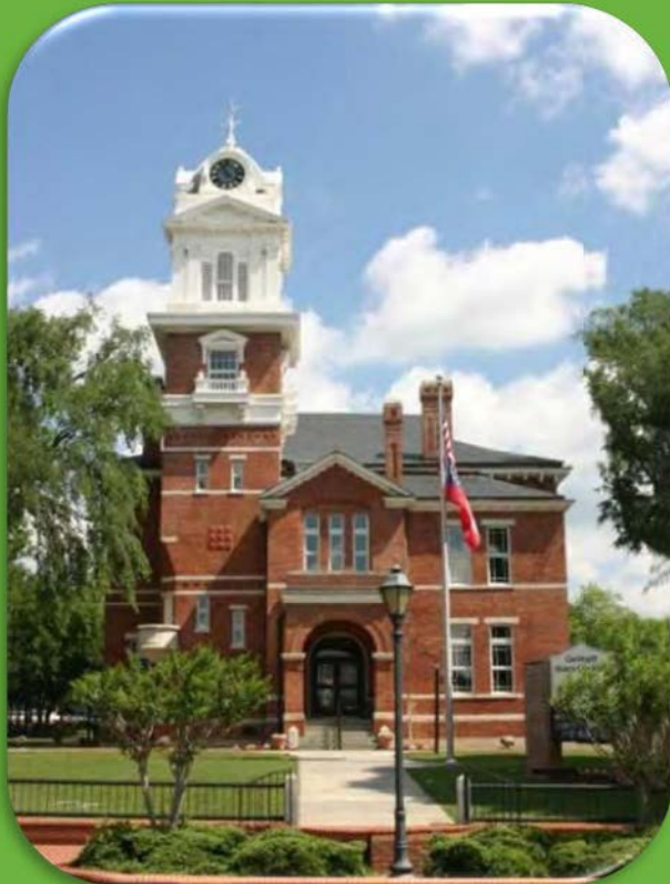
Gwinnett Historic Courthouse