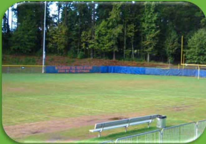
Mountain Park Park renovation