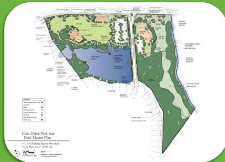
Club Drive Park Expansion