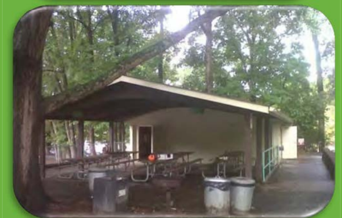
Jones Bridge Park renovation