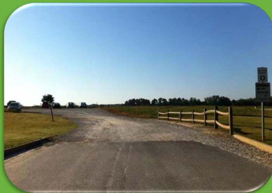
Alexander Park Expansion