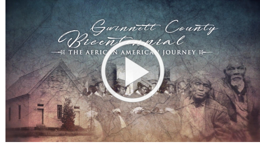
Gwinnett County Bicentennial: The African American Journey