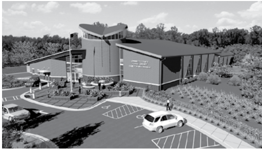
Hamilton Mill Library

in the state. The library will offer up to 75,000 books and other items for checkout, including adult, teen, and children's collections. The new library will open in the winter of 2010.