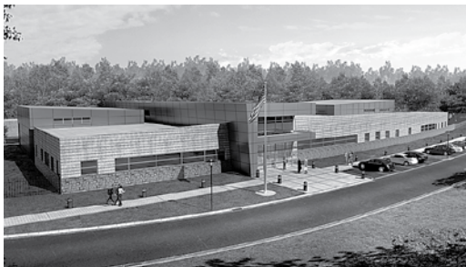
Police Headquarters Annex and E-911 Center

A new Police Headquarters Annex and E-911 Center scheduled to open in early 2010 is located on a nine-acre site at 872 Hi-Hope Road in Lawrenceville, immediately north of the existing Police Headquarters. The 45,000-square-foot one-story building will accommodate 180 employees along with a new, fully-equipped, state-of-the-art E-911 Communications Center, Emergency Operations Center, and backup data center to serve the County for at least the next 20 years. The building design meets Federal Emergency Management Agency standards for hardened first responder facilities. The new facility, which is funded by sales tax, general tax, and E-911 fees, will also be home to the police technical support and professional standards units.