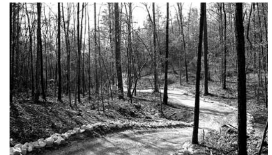
Harbins Park Soft-Surface Trail

Located in eastern Gwinnett County, the new Harbins Park is the county's largest park to date. The 1,289-acre park that will open on March 21 features a three-mile paved, multi-purpose trail, 18.3-miles of soft surface trail with sections for horseback riding, mountain biking and hiking, a tri-level playground, large rustic pavilion, restroom, and an equestrian-only parking area.