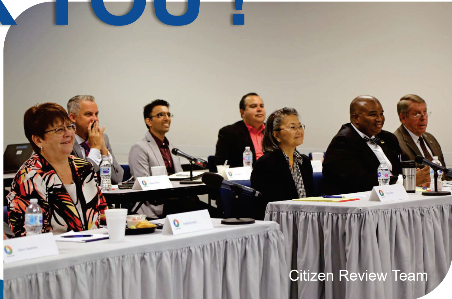
Citizen Review Team