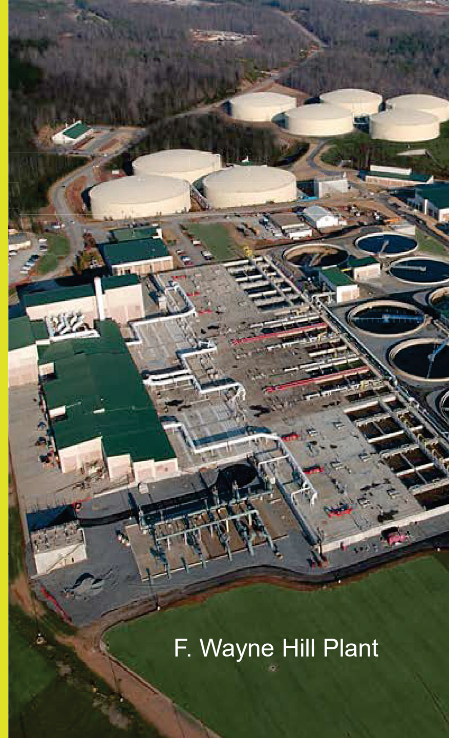
F. Wayne Hill Plant