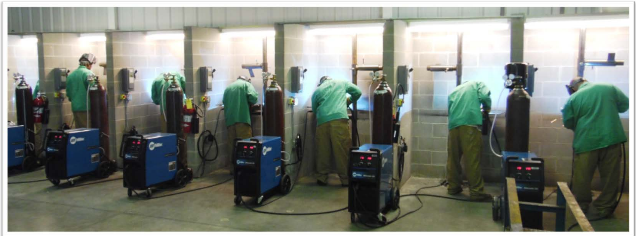
Welding Certification Course