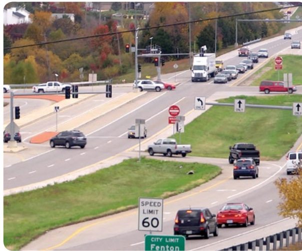
Fenton, MO DLT Intersection Source: DLT Video FHWA-SA-14-021