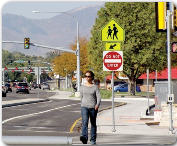
Salt Lake City, UT DLT Intersection

A DLT also can support community goals for pedestrians and bicycles. Provisions for walking and biking must be considered throughout the project development process, with the needs of pedestrians and bicycles shaping the overall design of the DLT accordingly. This includes pedestrian crossings that are accessible to all users, and traffic signal phases that accommodate both pedestrians and bicycles.