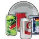
Aluminum and Steel (empty and dry)