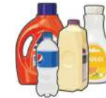
Plastic Bottles, Jars, and Jugs (no tubs, plastics #1 and #2 only, empty and dry)