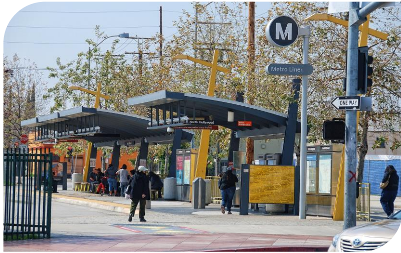
Example of a Small TTF