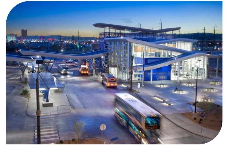
Example of a Large TTF