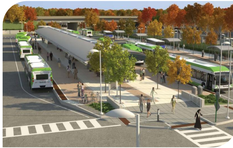
Example of a Medium TTF