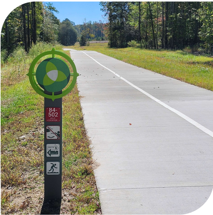
Eastern Regional Greenway