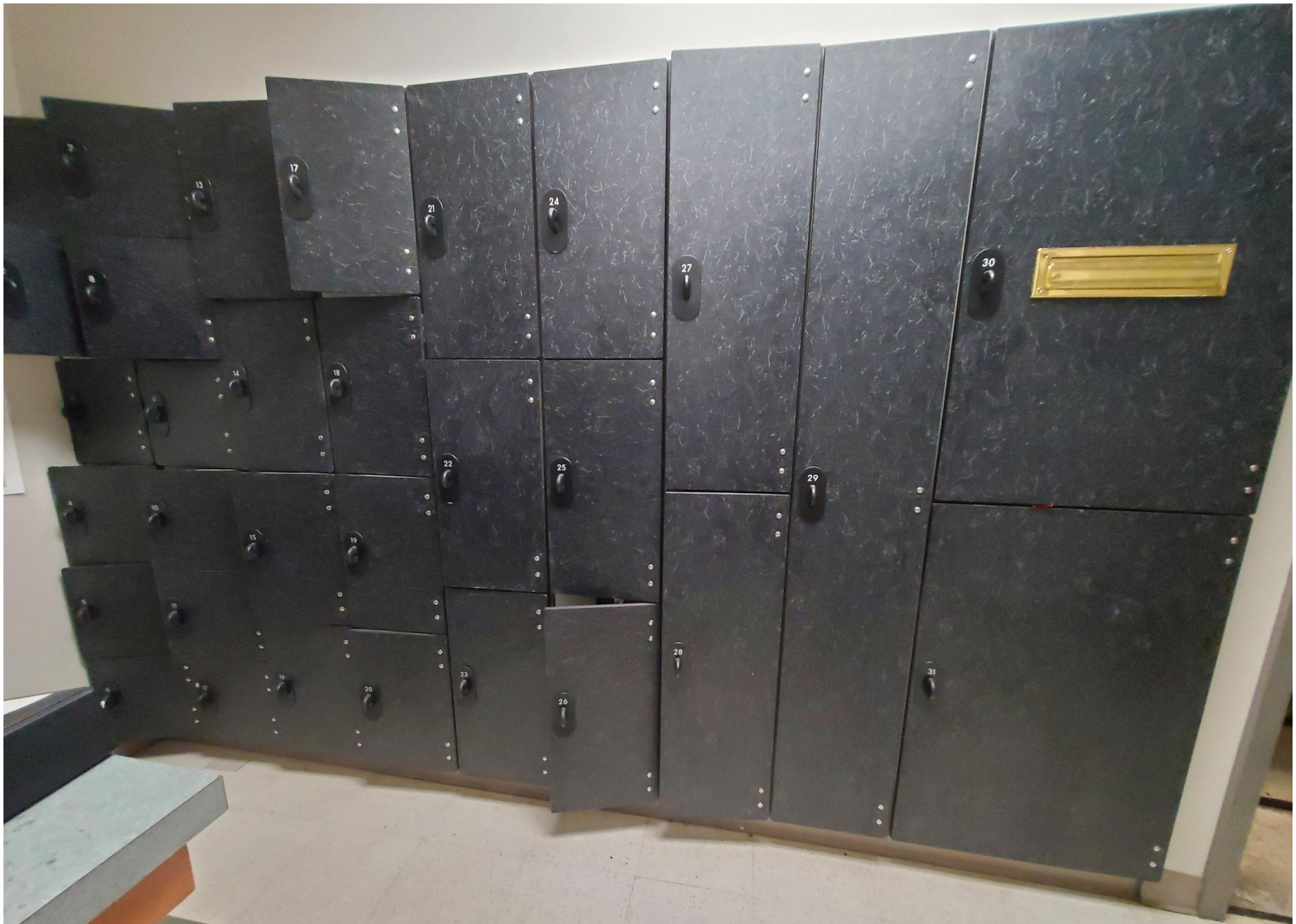
Exhibit A - Central Precinct: